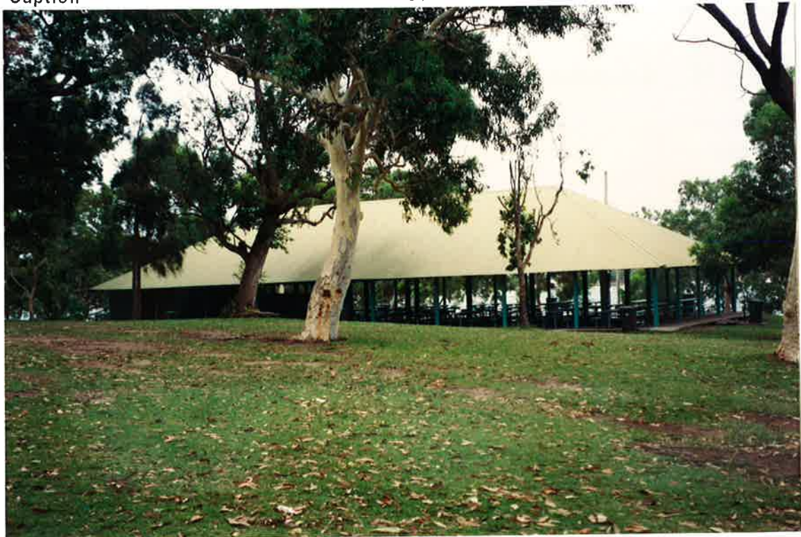
Photograph Film / negative nos: M/15 Caption Gunnamatta Park, Cronulla. Dressing pavilion, from East